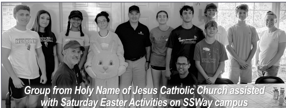
Group from Holy Name of Jesus Catholic Church assisted with Saturday Easter Activities on SSWay campus

Thanks, everyone, for sharing such a joyful day with SSWay’s community!