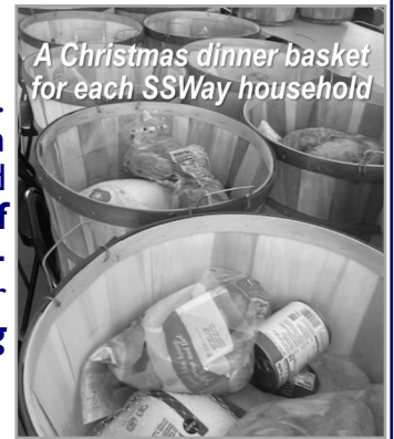
A Christmas dinner basket for each SSWay household

For Christmas last year, SSWay families benefited from two generous gifts. Erdman Automotive donated 40 “dinner baskets” of food, one for each SSWay household. Each basket contained a turkey, ham, potatoes, fruit, canned goods and more, suitable for preparing a large family meal. The Rotary Club of Melbourne Beach donated many boxes of toys so each SSWay child ages 1 to 14 could receive one. Toys were selected to be age-appropriate for three age groups: 1 – 3, 4 – 8, and 9 – 14. Our heartfelt thanks for sharing these Christmas gifts with our community.